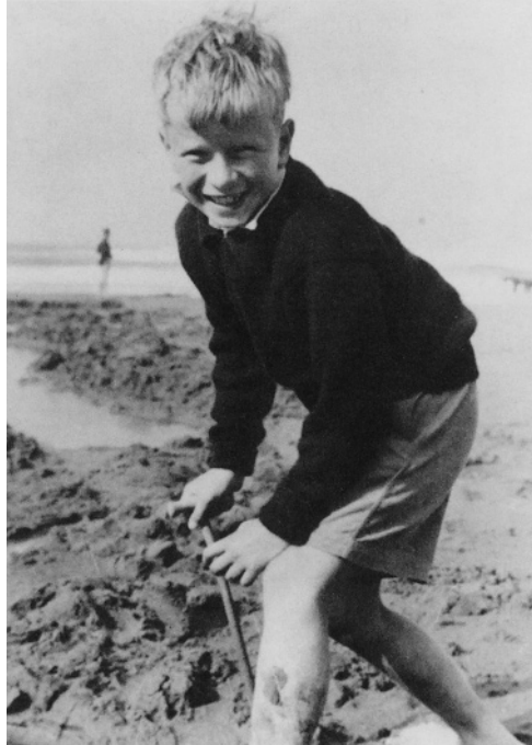
Fig. 3 Andrew Wiles in his childhood

Number theory and geometry, in particular diophantine equations and geometry, have been associated for about two millennia. In fact, it has been argued that the methods of Diophantus (ca. 250 AD) for the solution of diophantine equations could be viewed as geometric; these came to be known as the “tangent and secant methods” [4].