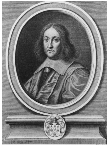
Fig. 1 Pierre de Fermat

The aim of this paper is to relate something of what happened in the three-and-a-half centuries between these two pronouncements, and, in particular, to describe some of the drama and the ideas connected with Wiles' proof.