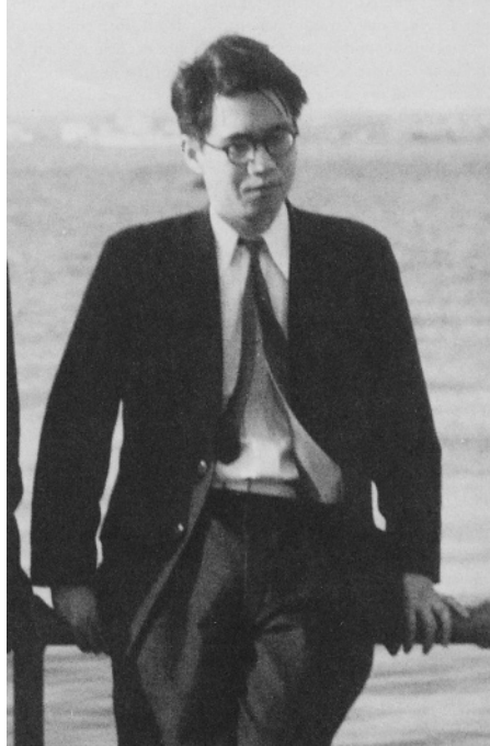
Fig. 5 Yutaka Taniyama