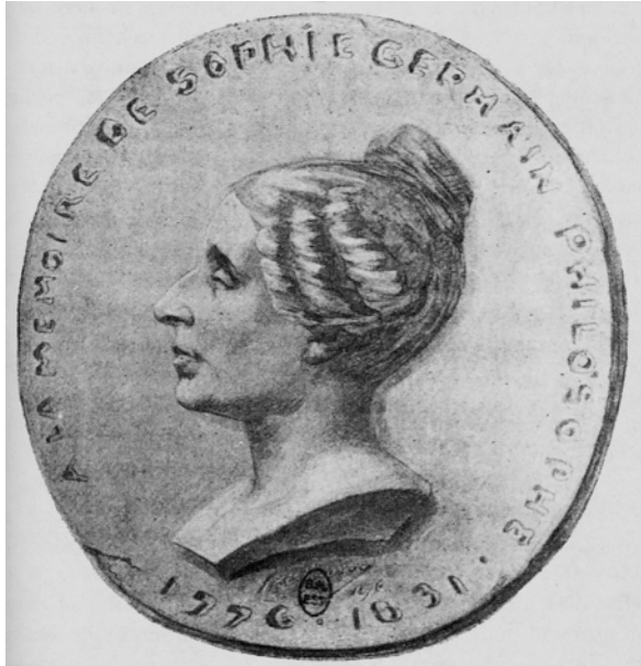
Fig. 2 Sophie Germain

The next strides in the proof of FLT were made by Legendre and Dirichlet, who, around 1825, independently established the theorem for n = 5 . In 1839, Lamé proved it for n = 7 . Incidentally, in 1832 Dirichlet showed that FLT holds for n = 14 but could not prove it for n = 7 ; the latter result, as we noted, implies the former.