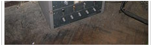
A 1960 Newmark analogue computer, made up of five units. This computer was used to solve differential equations and is currently housed at the Cambridge Museum of Technology.