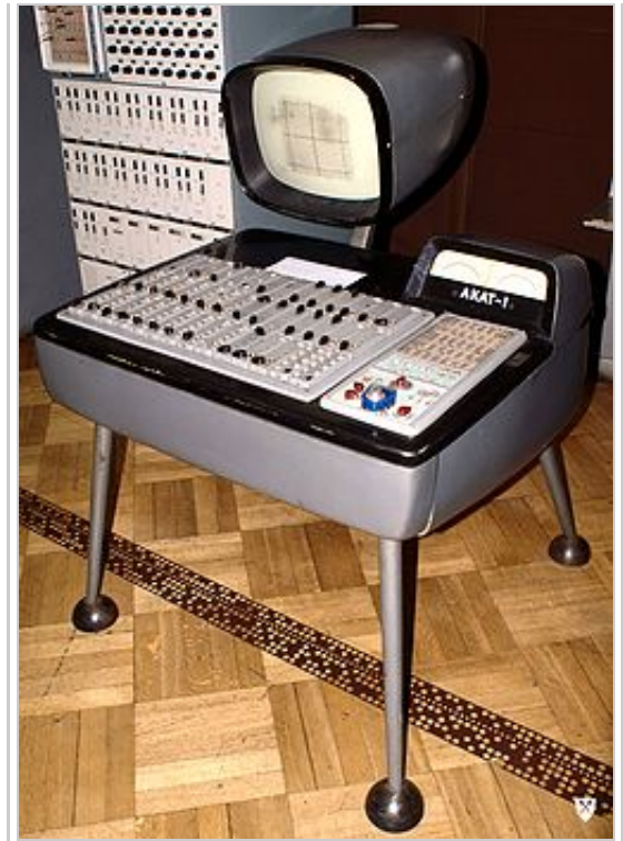
Polish analog computer AKAT-1.

An electronic digital system uses two voltage levels to represent binary numbers. In many cases, the binary numbers are simply codes that correspond, for instance, to brightness of primary colors, or letters of the alphabet (or other symbols). The manipulation of these binary numbers is how digital computers work. The electronic analog computer, however, manipulates electrical voltages that are proportional to the